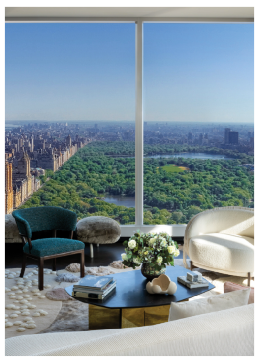
A $26 million model residence designed by Fox-Nahem Associates is perched on the 66th floor of Central Park Tower.